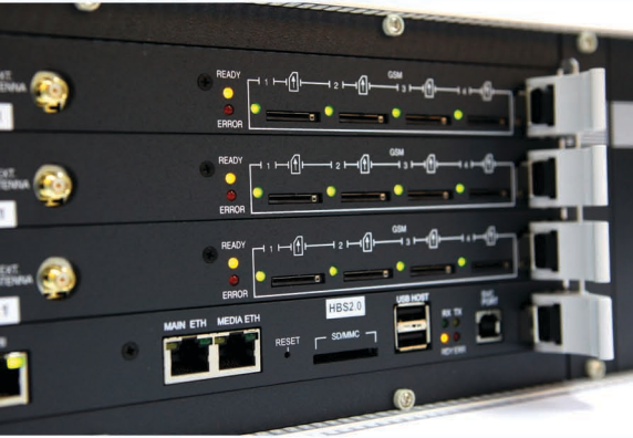
On-site Messaging API-based Unit

Enable sending and receiving of single and bulk SMS messages