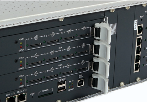
HG-4000/3U VoIP-GSM Gateway

Connect between your VoIP and GSM networks and reduce your operating costs