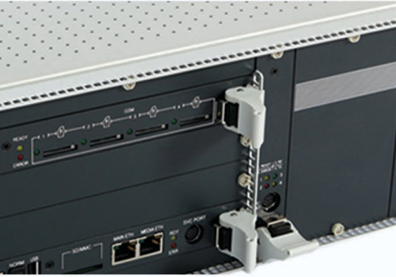
HG-2000/3U Quad-BRI Gateway

Connect to the GSM mobile network and maintain your BRI connection to the PSTN